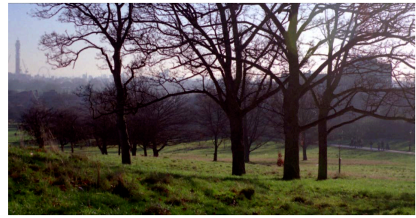
Towards St John's Wood - the north west