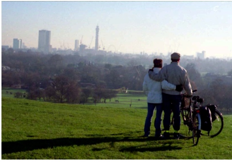
The view of London to the South