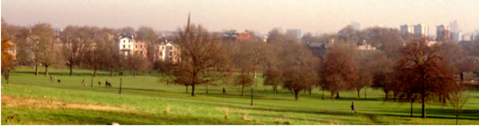
London viewed from Primrose Hill